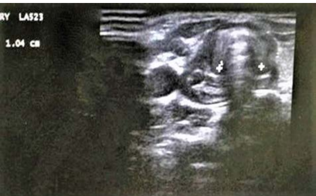
Figure 4: Ultrasound image showing measurement of the diameter of subglottic transverse air column at the lower edge of the cricoid cartilage

assessment was performed by the same senior anaesthesiologist and done when Train-of-Four was < 10\% which was considered as the onset time of muscle relaxation. The position of the ETT was confirmed by capnography and the presence of bilaterally equal breath sounds.