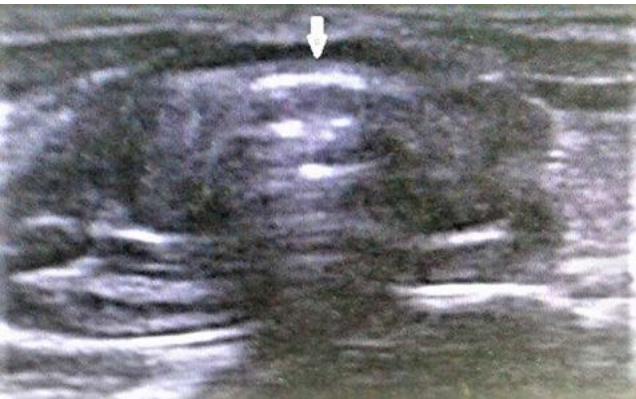
Figure 3: Ultrasound image with the arrow identifying the cricoid cartilage as a hypoechoic rounded structure