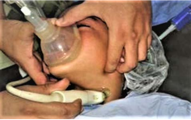
Figure 2: The placement of the linear ultrasound probe on the middle of the anterior neck at the cricoid cartilage level